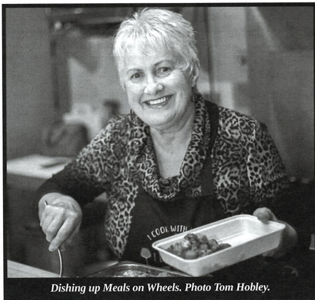
Dishing up Meals on Wheels.